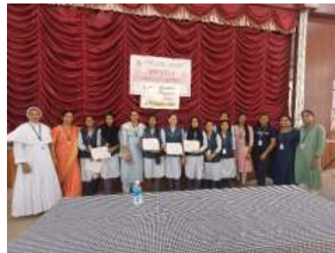
Stitching Certificate issuing ceremony