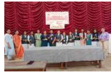
Driving license issuing ceremony